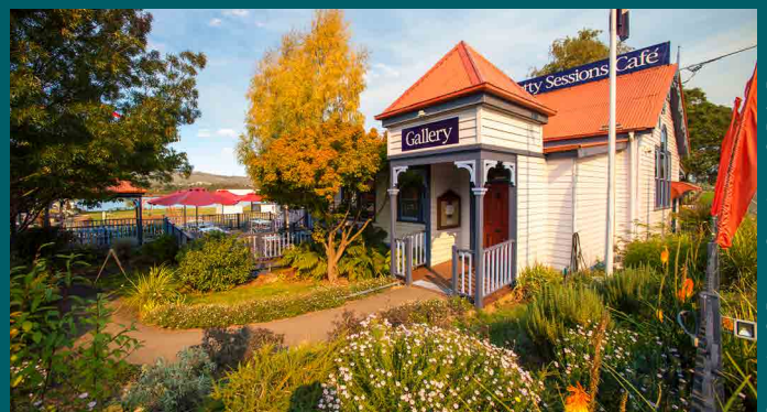
Osteria @ Petty Sessions

Taste artisanal cheeses, beer and bread, and watch the makers at work.