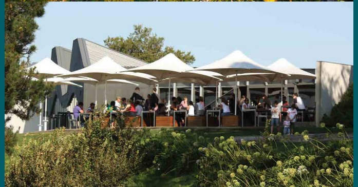
Peppermint Bay Hotel